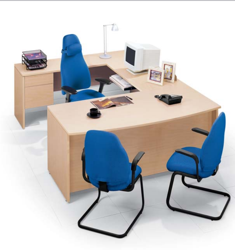
Shown with Adaptabilities, Management suite with 4470 High Back Multi Knee-Tilter and 4416 Armchairs

BIFMA Ergonomics Guideline Ultimate Test for Fit 2002